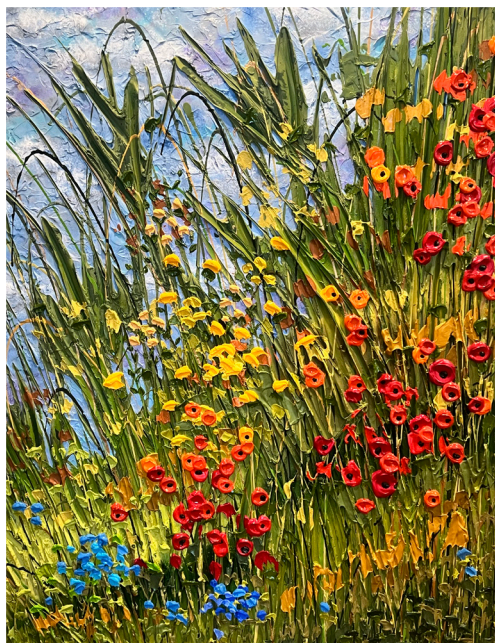
Drive to San Gimignano 2022