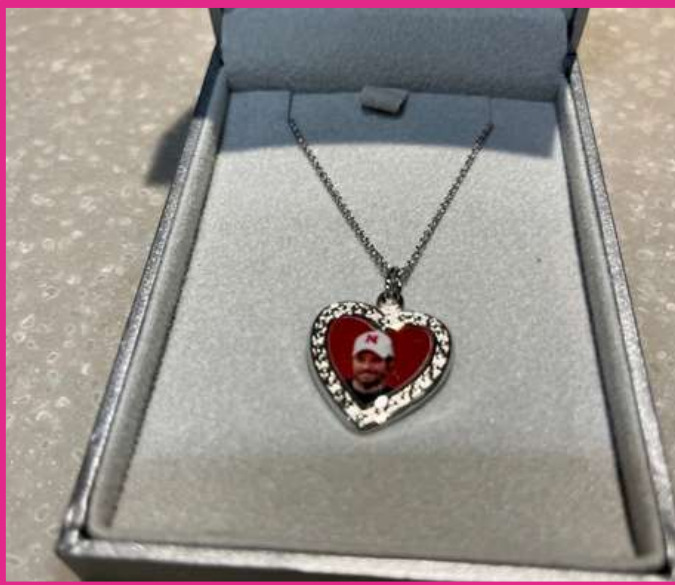
Photo necklaces are treasured keepsakes. Each necklace features an enameled image of either a parent or a parent with their child. A silver chain accompanies every photo charm, adding to its charm. These necklaces serve as a heartfelt reminder of the love and bonds shared within a family, especially during times of loss. Each piece, crafted with care and encased in durable clear resin, holds a cherished photo that captures a moment in time. As you wear these necklaces, they will undoubtedly evoke warm memories and a sense of closeness, keeping the spirit of your loved one alive in your heart.