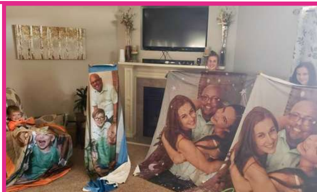
Photo blankets make wonderful keepsakes for kids of all ages. These blankets are cozy and comforting, featuring anywhere from one to five photos and available in the child's favorite color(s). Additionally, some blankets can be personalized with a term of endearment or a special message. These blankets not only provide warmth but also envelop your child in cherished memories.